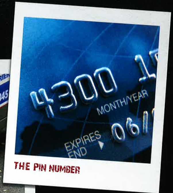
THE PIN NUMBER